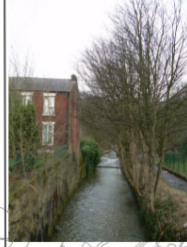
17 River Spodden Valley