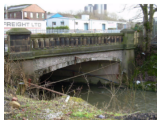
Listed concrete bridges 9