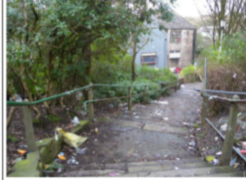
18 Public realm improvement