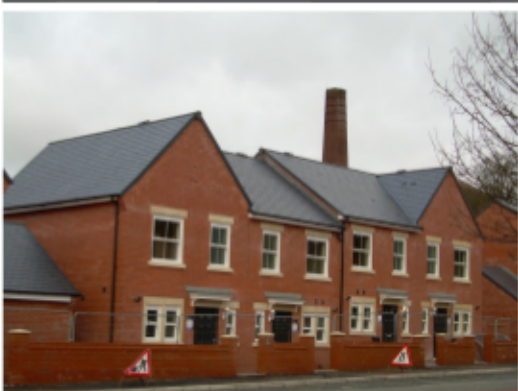
7 Residential development sites