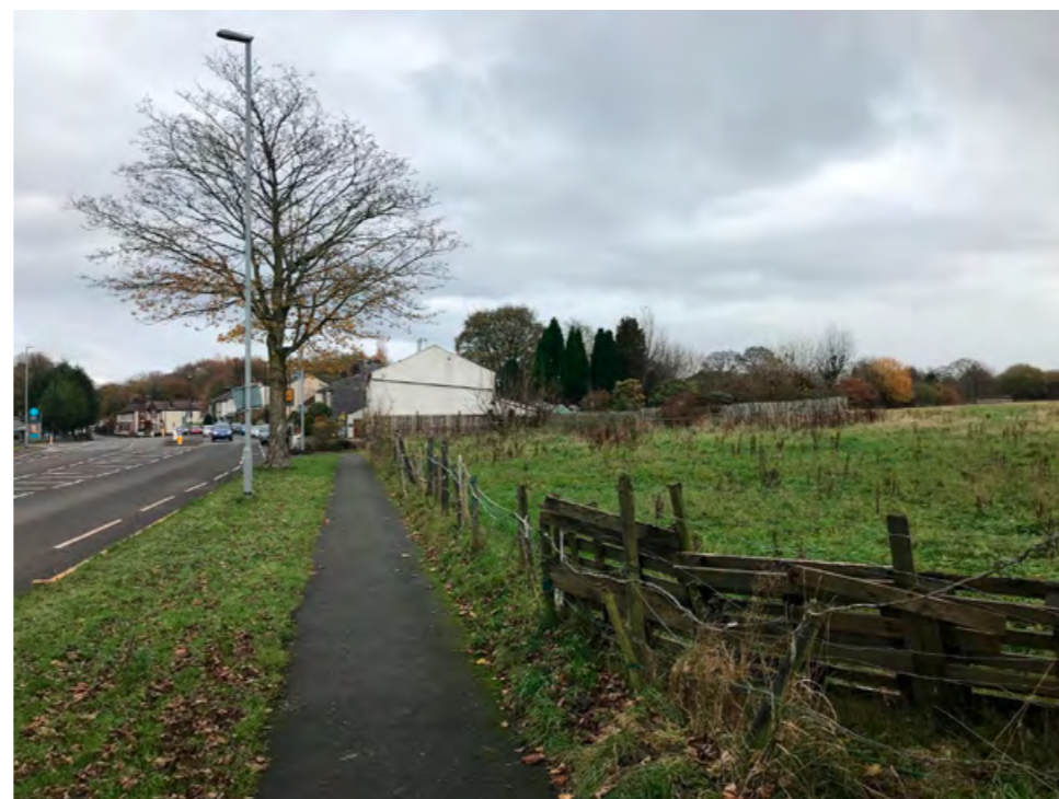
4. View along the site frontage looking north along Heywood Old Road