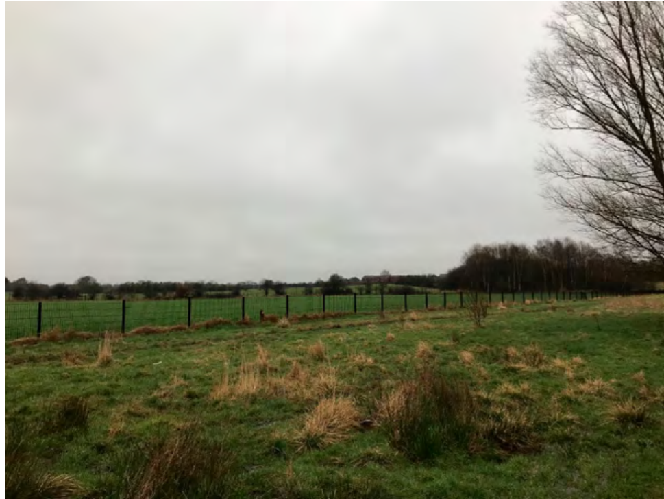
1. View over site from Bowlee Bungalow