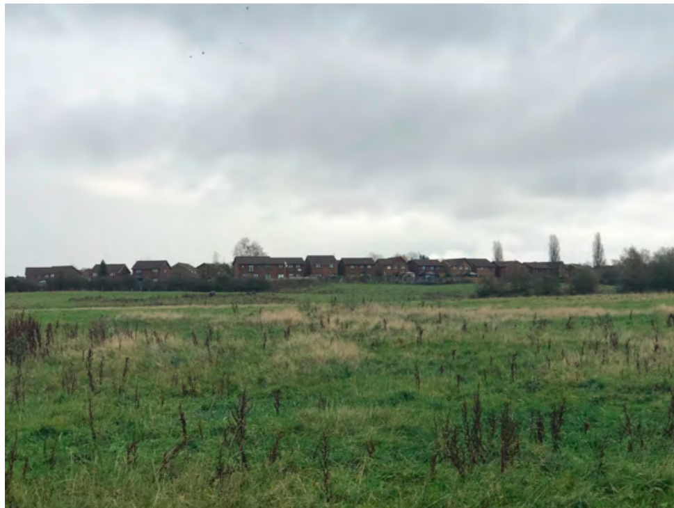
3. View into the site from Heywood Old Road towards the Langley Estate