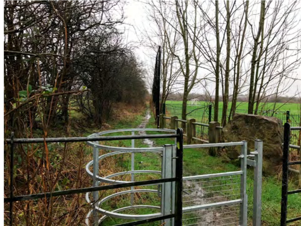
2. Entrance of Bowlee Park from Assumption Road