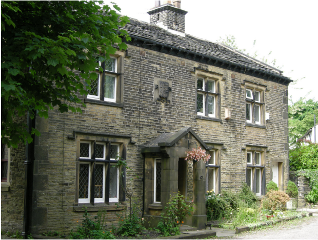
Nos 42 and 44, Falinge Fold