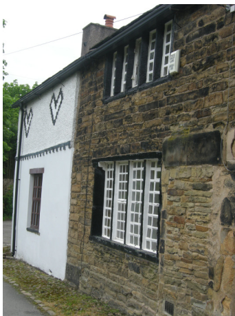
No's 34 & 36 Falinge Fold