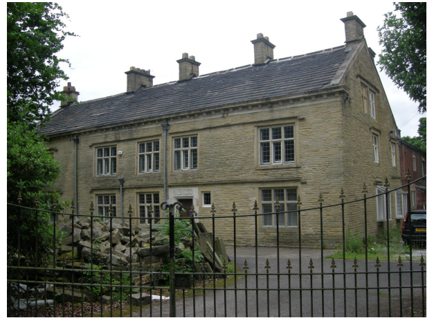
Old Falinge, Falinge Fold (Grade II listed)

The architectural and historic value of the proposed Falinge Fold Conservation Area lies within its distinctive character as a result of its historic development from the mid 17th century and later with the notable mercantile and banking family, the Royds.