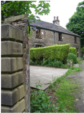
No's 50-54 Falinge Fold (from Old Falinge)