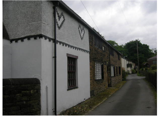
No's 32-36 Falinge Fold (Grade II listed)